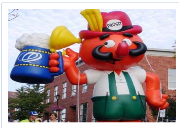
"Prosit!" Thanksgiving Day Parade at the Kitchener-Waterloo Oktoberfest celebrations