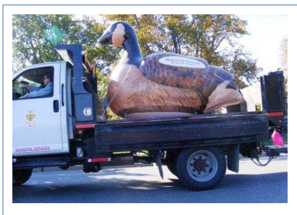
"Canada Goose Inflatable" at the Migration Festival Parade in Kingsville