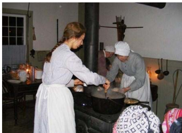
"The Keene Hotel Kitchen" Christmas by Candlelight at Lang Pioneer Village

Please see Where History Comes Alive! on page 3