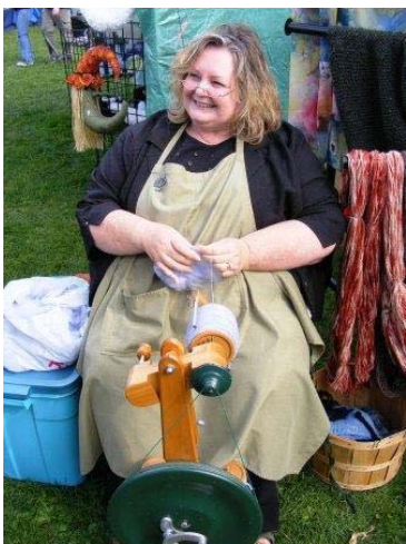
“Spinning” O’Shavings Country Craft Show in Vineland

“... lazy days spent by the the warmth of a fire ”