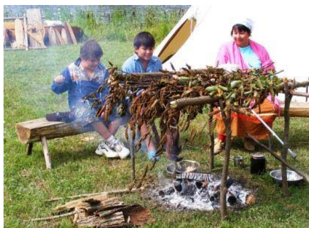
"Smoking the goose" Fur Trade Re-enactment at Lang Pioneer Village